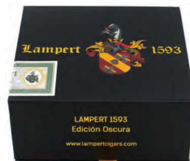
Travel box Short Robusto