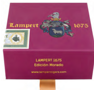
Travel box Short Robusto