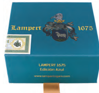
Travel box Short Robusto