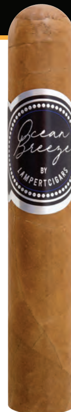
Robusto Grande 5 x 54