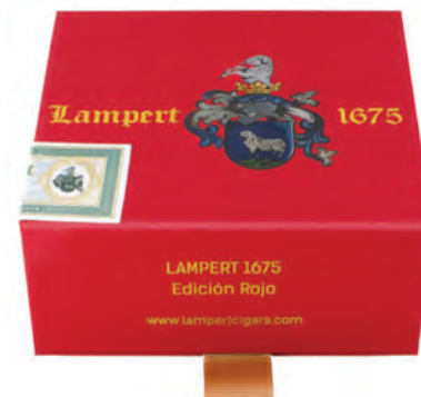
Travel box Short Robusto